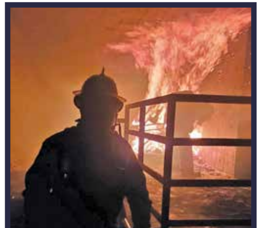
I joined the Mt. Penn Fire Department for their active fire training, giving me a first-hand look at their skill and bravery in action.