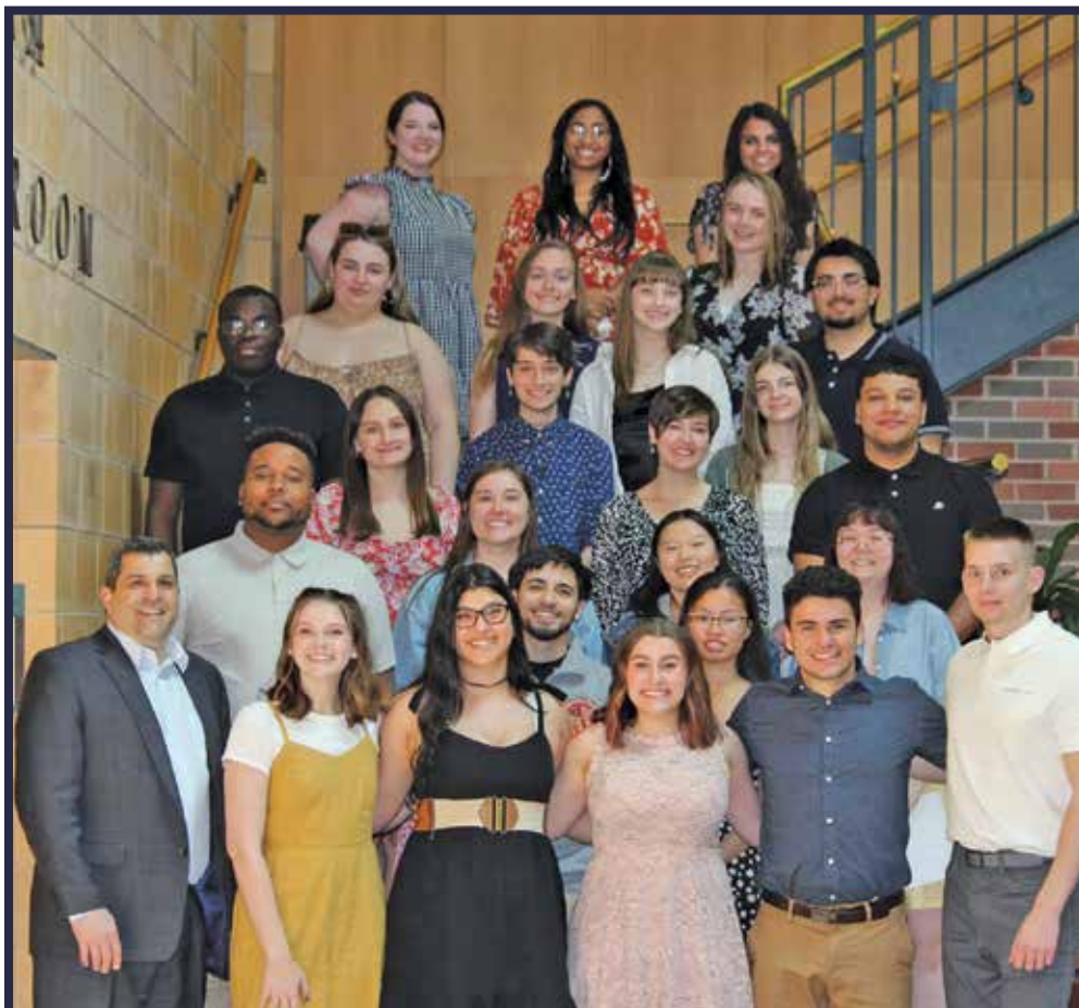
Congratulations Kutztown University Student Government Board on a successful year and thanks for making my birthday so special.