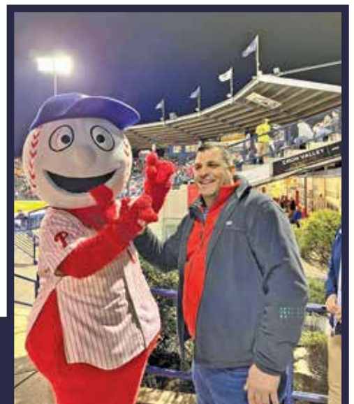
Opening night for the Reading Phils is always a hit! I was proud to help bring $7.5 million home for upgrades to FirstEnergy Stadium to keep the Fightin' Phils right here in Reading.